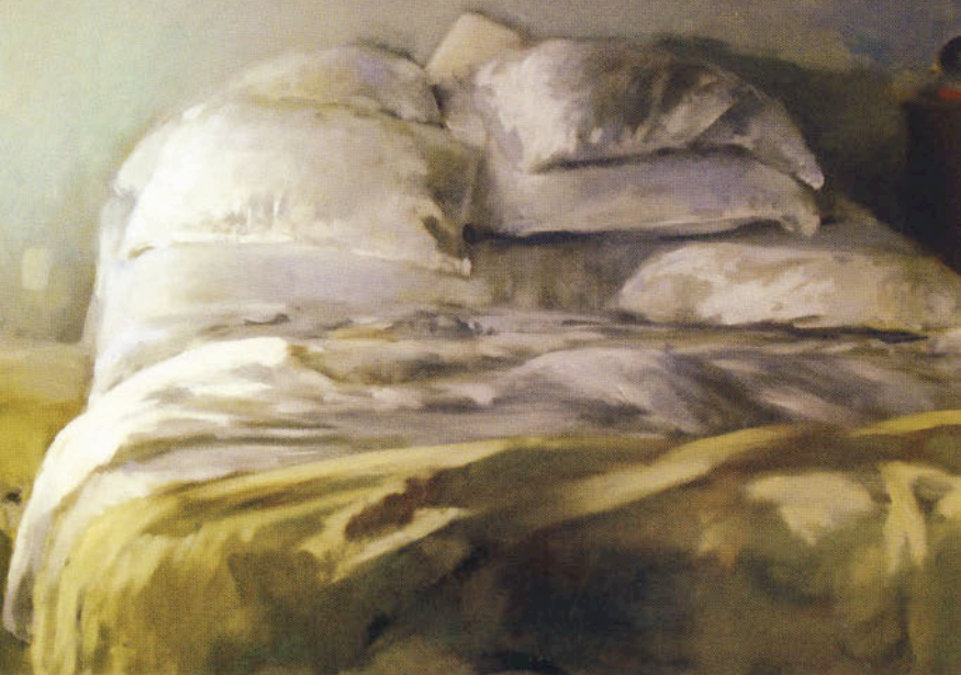
Marc Whitney Quiet Saturday , Oil, 30 x 40 inches