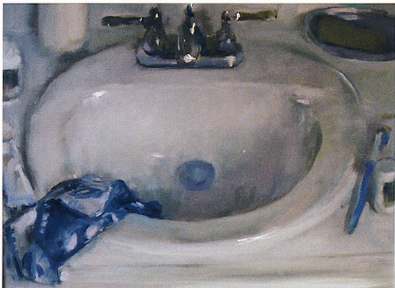
Marc Whitney White Sink With Blue and White Cloth , Oil, 18 x 24 inches